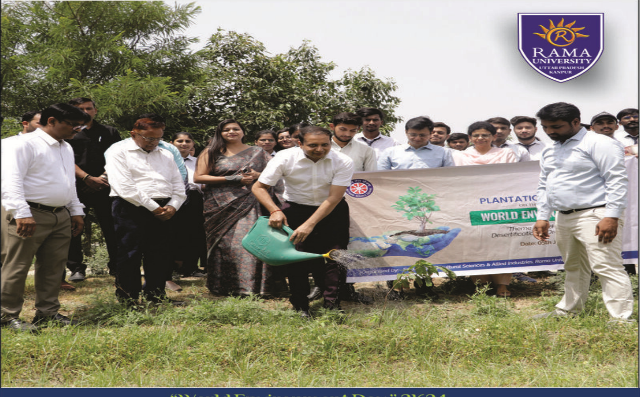
"World Environment Day" 2K24

5 June, 2024 | Rama Ayurvedic Medical College & Hospital, Mandhana, Kanpur