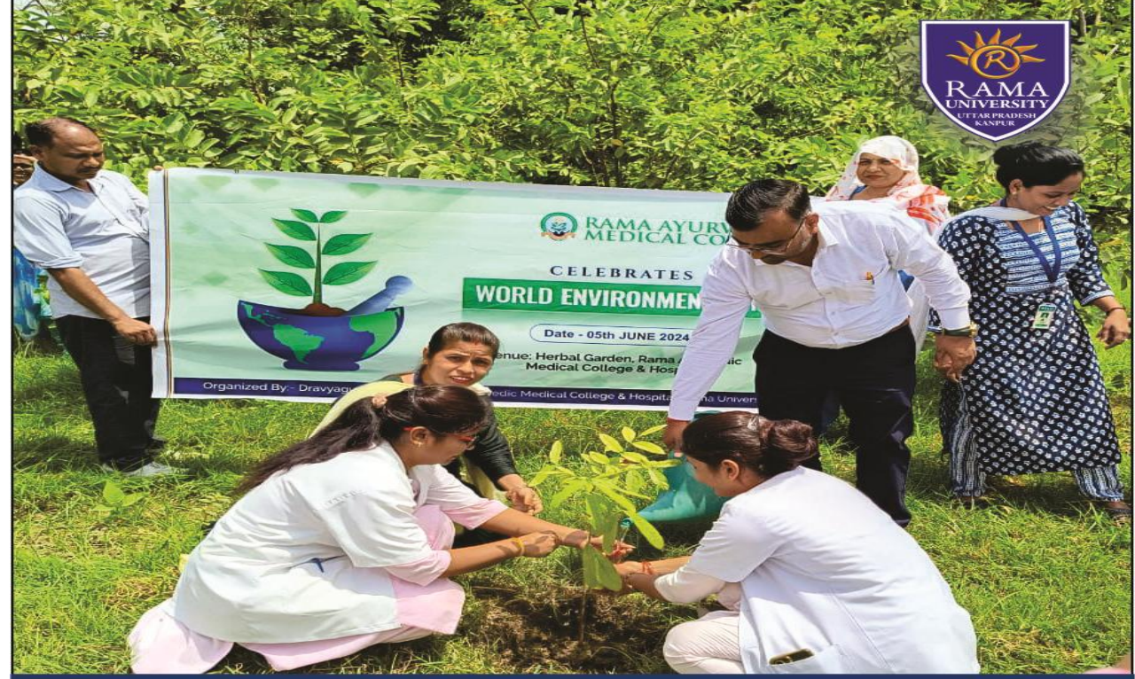
"World Environment Day" 2K24

2024: World Environment Day – 05/06/2024